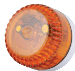
Solex Amber - White Base