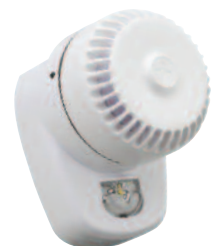
RoLP LX Wall White